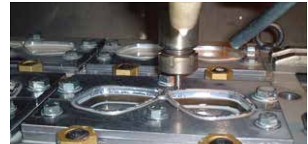
Luxurious aluminum alloy machined frame delivers the accuracy and quality without compromise.