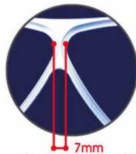
The metal frame attains width of the center portion of frames as only 7mm. It feels like a single lens mask.