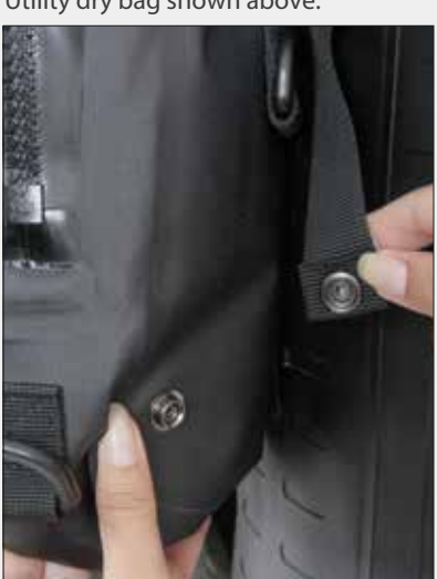
Webbing weaves through MOLLE panels and press stud secures attached bag in place.