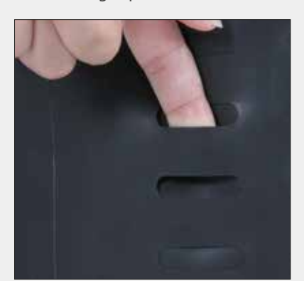
Close up of the MOLLE panels.