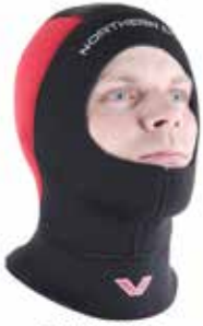
DRYSUIT HOOD Please note style may vary