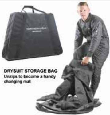
DRYSUIT STORAGE BAG Unzips to become a handy changing mat