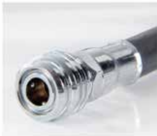
STANDARD HOSE Please note hose supplied will match valves provided